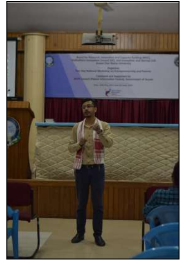
Day 2 Concluding Session