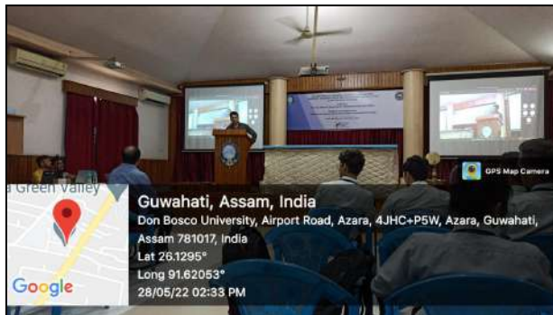
Day 1 Session 3