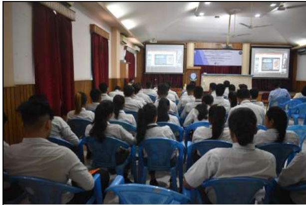
Day 2 Participants