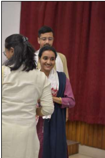
Day 2 Concluding Session