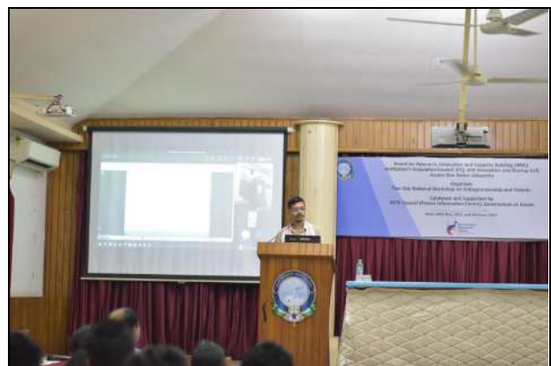
Day 2 Session 3