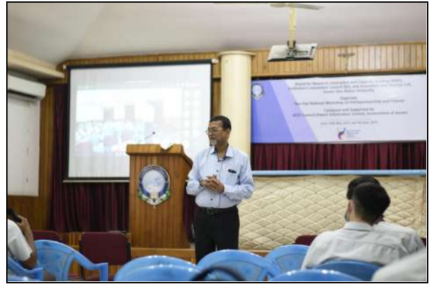
Day 1 Session 1