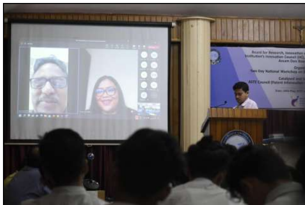
Day 2 Session 1