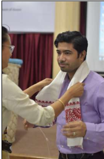
Day 2 Concluding Session