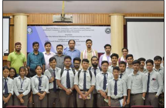
Day 2 Concluding Session