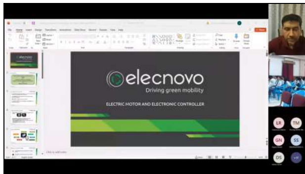
Day 1 Session 2