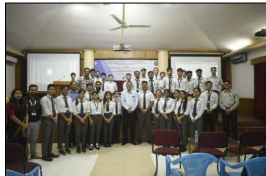
Day 1 Session 1