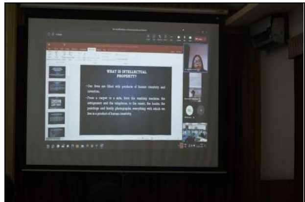
Day 2 Session 1