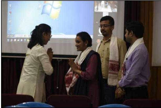
Day 2 Concluding Session