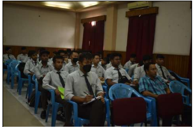
Day 2 Participants