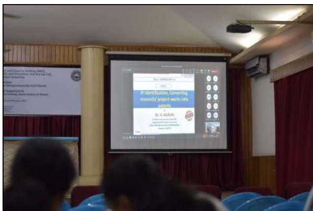
Day 2 Session 2