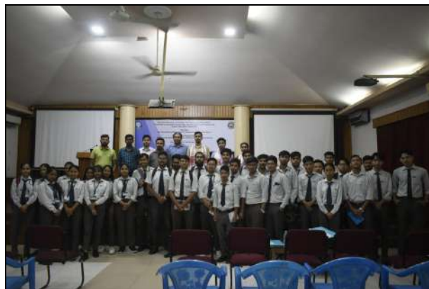
Day 2 Concluding Session